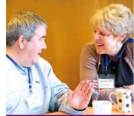
Our committed volunteers provide consistent support at the weekly group meetings.

We actively encourage and support people with aphasia to consider volunteering as part of their ongoing recovery. At least a quarter of all members currently engage in some type of volunteering, from Ambassador roles for Dyscover, to roles in research, fundraising or community activities.